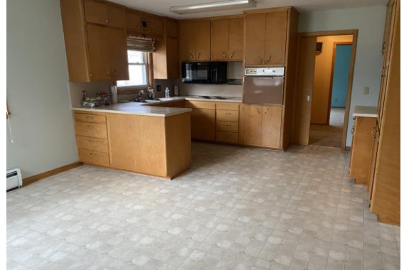
Visit our Website at www.mayberryrealty.net Remarks: The information on this sheet is believed to be accurate, but we are not responsible for any errors regarding this information.